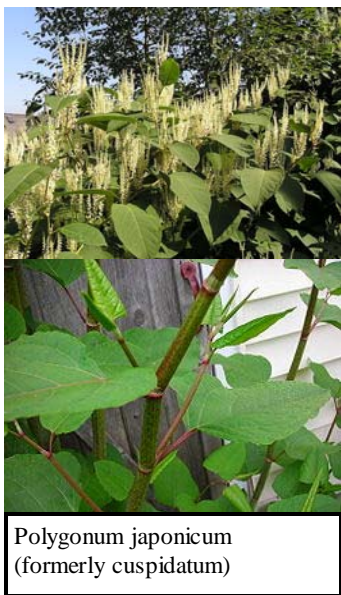
Polygonum japonicum (formerly cuspidatum )

Giant knotweed has been declared Britain's Worst Weed, having spread greatly over the past fifty years, largely as a result of frantic efforts to get rid of it. People dig it up and take it to a dump or leave it in the countryside from where it marches on and on. It is the Genghis Kahn of the plant world – all conquering. It is not on the Gardenworks