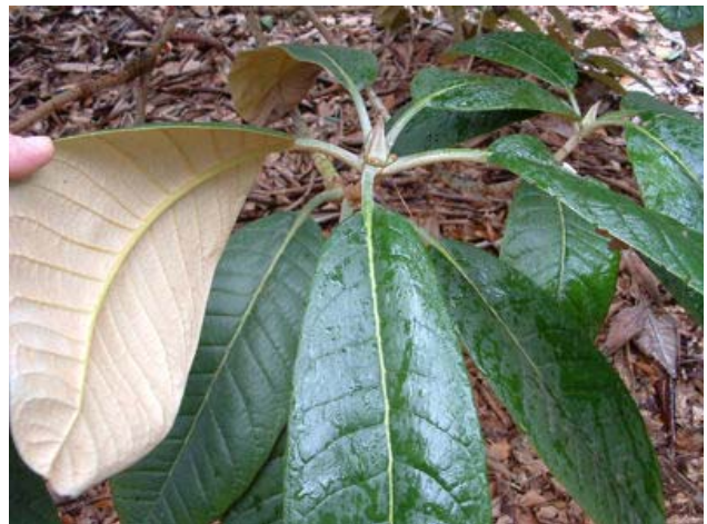
R. hodgsonii , a big leafed rhododendron

At this point in the narrative, the newsletter reported that gasps of astonishment rose from the audience for they were horrified to hear of