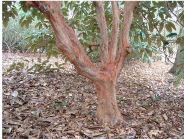
A small tree of R. hodgsonii