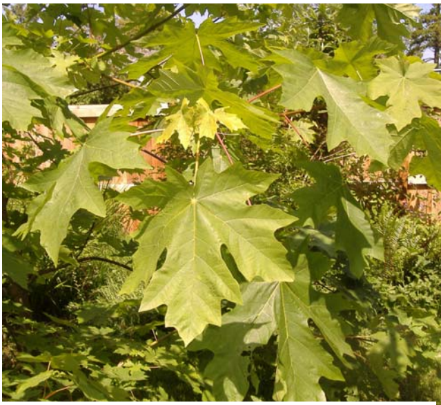
Acer macrophyllum , having the largest leaves of any acer.

Yes, it seems there are species snobs even in the Maple societies and the most far-out are the lovers of large-leaved species. These obses-