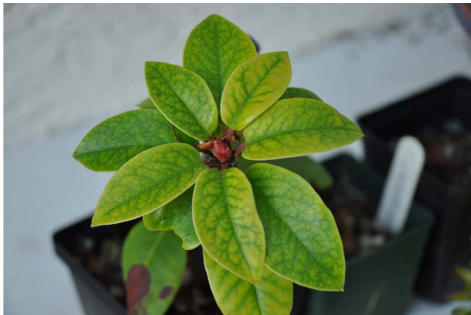
Chlorosis indicating iron and magnesium deficiencies

*This symptom often is associated with soils where calcium from building operations, old foundations, sidewalks, or brick walls has leached into the soil over a long period of time and has made iron unavailable to the plant. In cases such as this, apply sulfur or other acidifying elements to counteract the calcium.