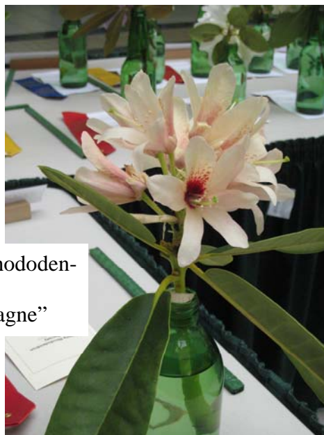
A Fujioka hybrid rhododendron in bloom, R. "Starbright Champagne"