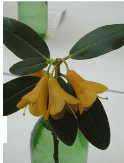
Rhododendron "Transit Gold", part of the logo for the VRS.