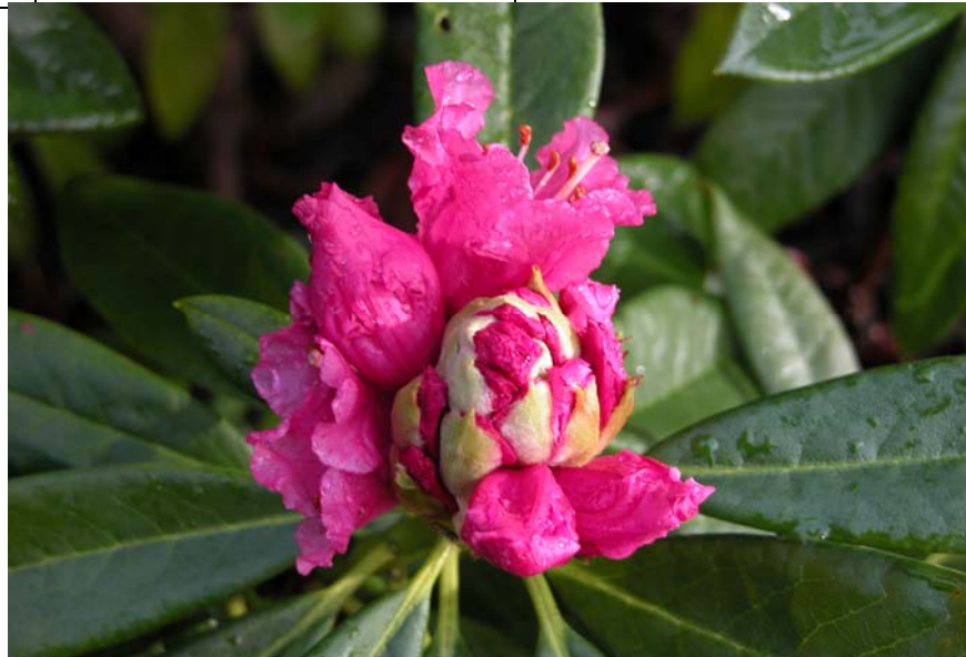
R. Lee’s Scarlet in December