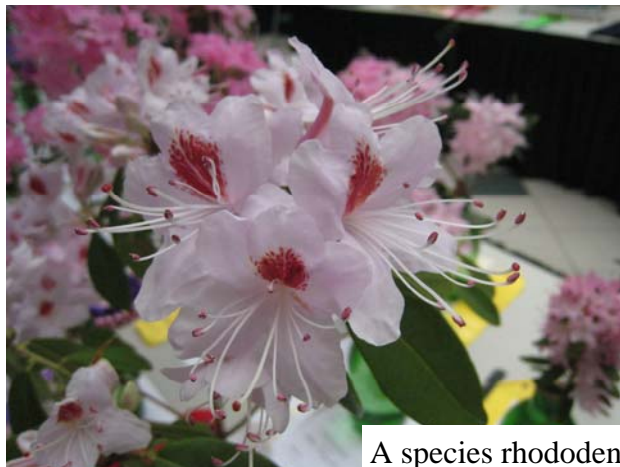
A species rhododendron in bloom, R. yunnanense

Many members brought non-perishable food and the proceeds from the raffle, about $300, were very much appreciated by the Mustard Seed Food Bank.