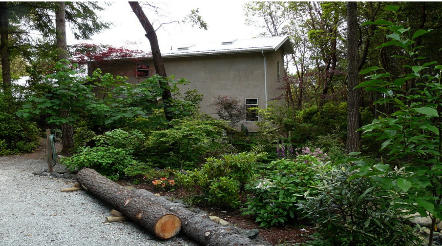
R. smirnowii x yak - age 10 in 2008

As parents you nurture your children, feed and care for them, watch them grow into young adults and then they leave home to start a new life of their own. Sometimes our rhodos do the same.